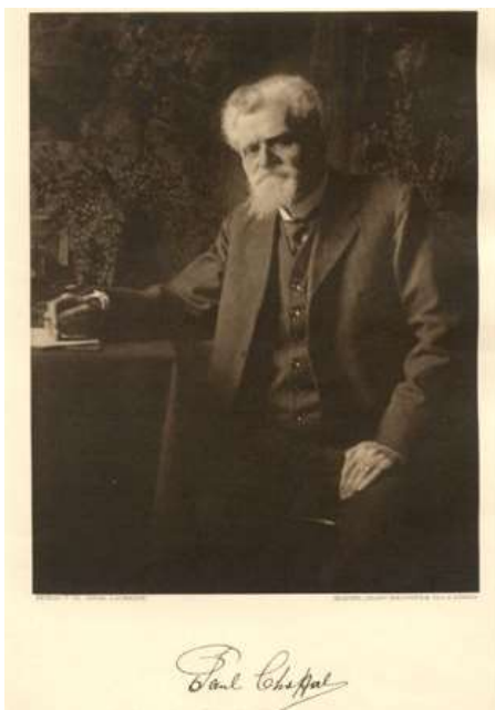
Figure 4: Paul Choffat in mid 1919. (Photo: AHGM, LNEG).

These exposures have been studied since 1849 for geological purposes. They reveal a 65 meters thick stratigraphic succession with ammonites and abundant benthic invertebrates. The local sequences of shallow marine carbonated facies were fully studied by the Swiss geologist Paul Choffat (1849-1919) of the Portuguese Geological Survey, and used to compare and correlate faunal associations of the Tethyan and Temperate domains, during the Cenomanian-Turonian transition in Western Europe (fig. 4).