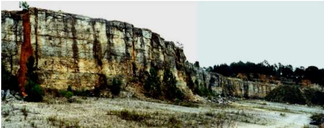
Figure 3: The main quarry of Salmanha, Figueira da Foz, showing the Cenomanian fossiliferous beds that have been studied since the nineteenth century.

set of large outcrops situated in the “classic” localities of Salmanha (Figueira da Foz), Fontela, Vila Verde and Lares, near the local railway to Coimbra (fig. 3).