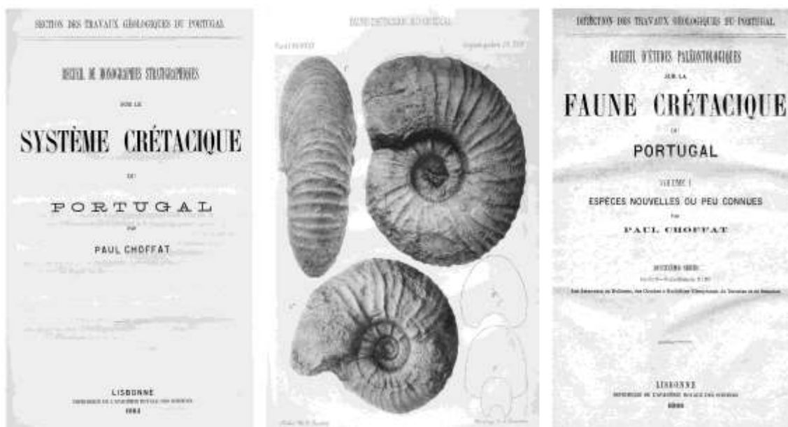
Figure 5: Front pages and plate of monographs published by Paul Choffat after 1885. They provide detailed descriptions of the Portuguese Upper Cretaceous stratigraphy and invertebrate faunas, including those from Figueira da Foz focused on this study.

At the same time, the contemporary scientific work has resulted in a substantial list of monographs that described aspects of the Cretaceous stratigraphy and palaeontology of Figueira da Foz and related sections from the Baixo Mondego region. The works of Daniel Sharpe (1849a, 1849b, 1849c), Paul Choffat (1886, 1898, 1900, 1901-02, 1927), Perceval de Loriol (1887-88), Gaston de Saporta (1894) and Henri Sauvage (1897-98), among others, are excellent examples of this rich bibliographic background and historical setting that allow us to reveal the importance of the area for geological heritage purposes (fig. 5).